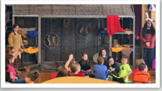
Palermo Elementary School

The Merry-Go-Round Playhouse, of Auburn, NY, brought an exciting, interactive program to all three elementary schools in the Mexico District in mid-December. Fourth grade students study