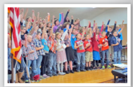
Palermo Elementary School

Veterans Day Celebrations were held at all three elementary schools in the Mexico District in November and veterans related to students attended as guests. Mexico High Junior Reserve Officer Training Corps opened the ceremonies and patriotic music, readings and more followed to honor the US Military Veterans service to our country.